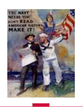
USS PYRO ASSOCIA- TION