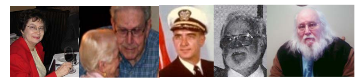
Scenes from the USS Pyro 2014 Memorial Service Aboard the USS Wisconsin in Norfolk, Virginia.