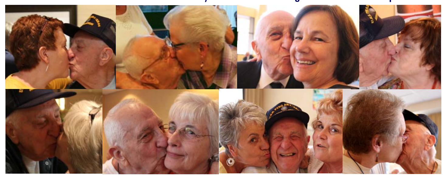
Pyro Reunion First-timers