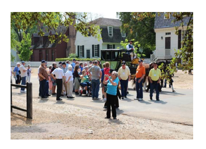
The crew gathers on Williamsburg's main street.