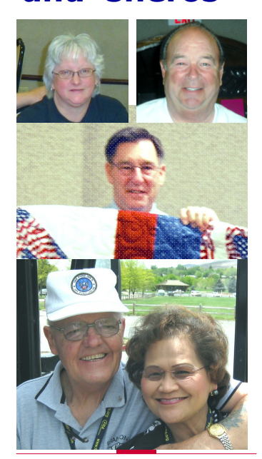
USS PYRO ASSOCIATION