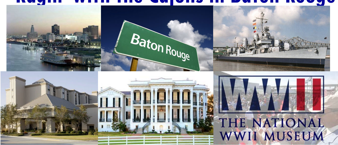
Wednesday 16 May 2012

18:00 Registration and Welcome Aboard Reception. Arrive in Baton Rouge at your leisure. Log in and get reacquainted with old (and young) shipmates in the hospitality room. Welcome reception and Hospitality Room membership with adult refreshments included throughout the reunion. Remainder of the evening free.