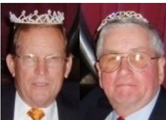
The scholarship 'kings'