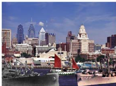
REUNION 2007 PHILADELPHIA, PENNSYLVANIA MAY 2-6, 2007

It is the biggest memory book to date with more than 50 pages of high resolution photos. The package also included as many of the raw photos shot by our very talented volunteer photographers as would fit on the disk.