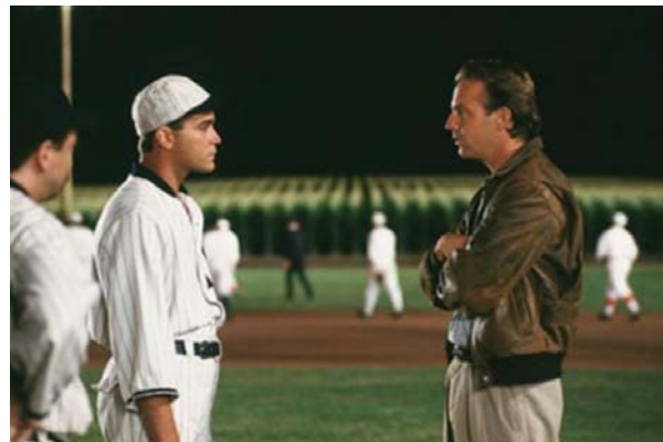
"Is this heaven?" "No, it's Iowa..."

T he arrangements haven't been quite finalized at The Scuttlebutt deadline, but, if the good Lord's willing, the creek — or more accurately, the Mississippi — don't rise, and the final contracts mesh