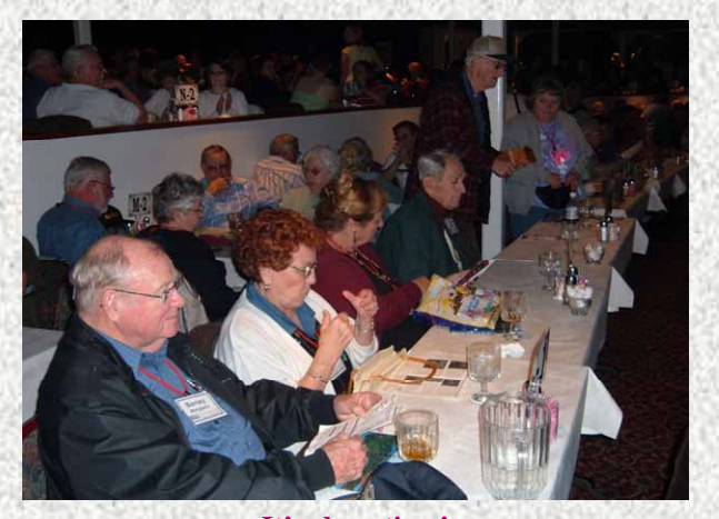
It's show time!