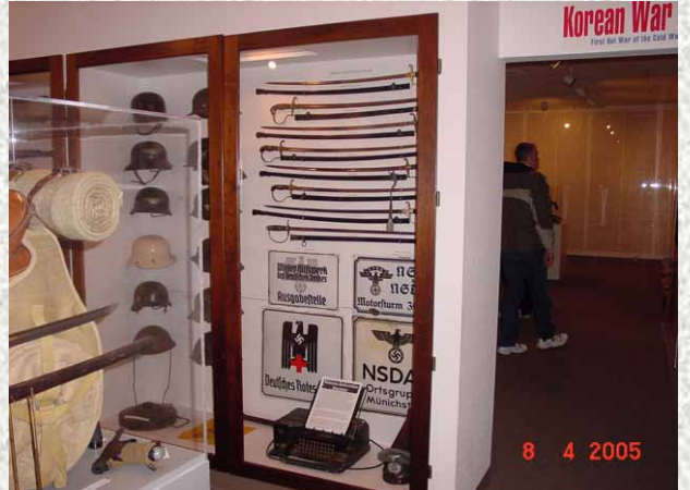
The weapons of war