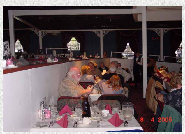
Much like the Pyro's mess hall...