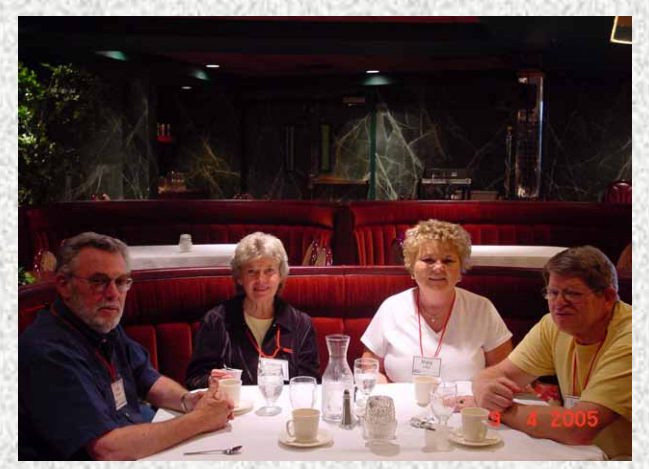
The Sieverin and Ellis clans