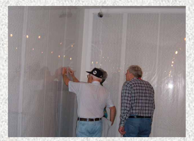
Remembering fallen comrads ..