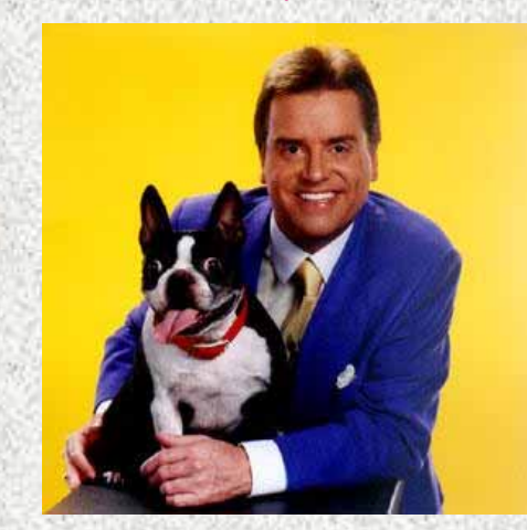
Talking dog Irving and ventriloquist Todd Oliver stole the show