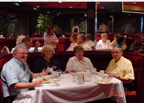
The Strunks and Worrells