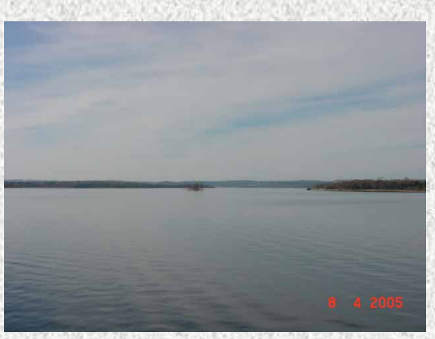
Is this Olongapo I see before me?