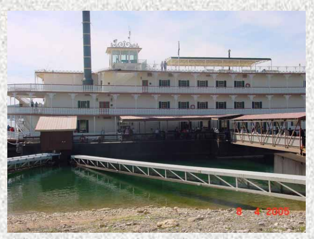
The Branson Belle's bow