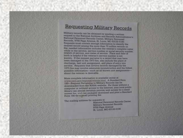
This privately funded museum is looking for records and memorabilia.