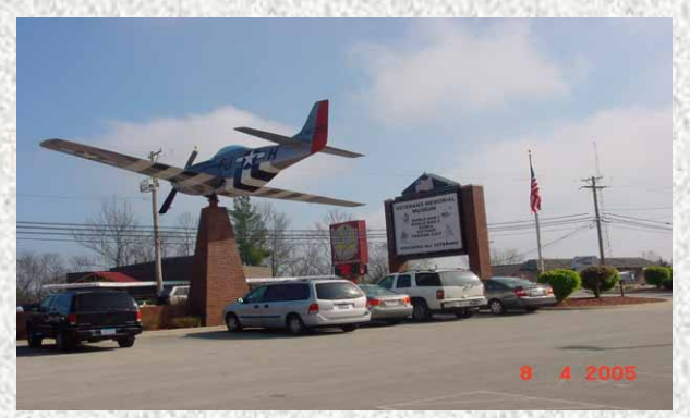
Mom, there's a fighter in the parking lot!