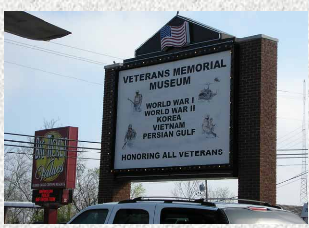
First tour stop: The Branson Veterans Memorial