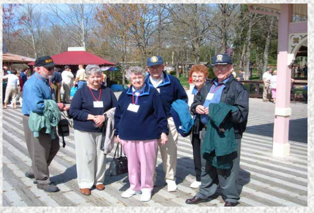
All ashore who are going ashore