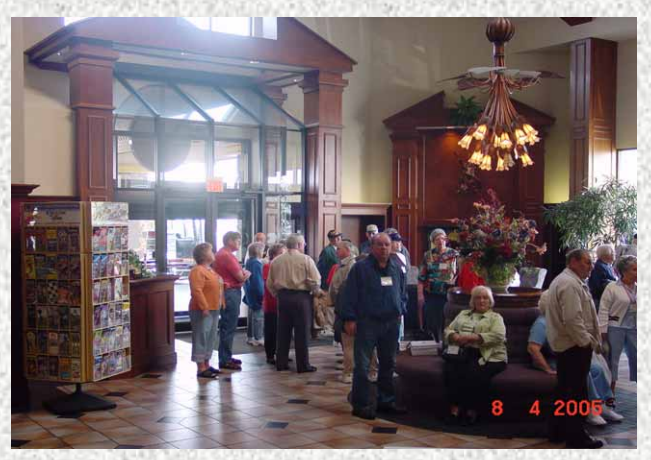
The crew musters in the hotel lobby