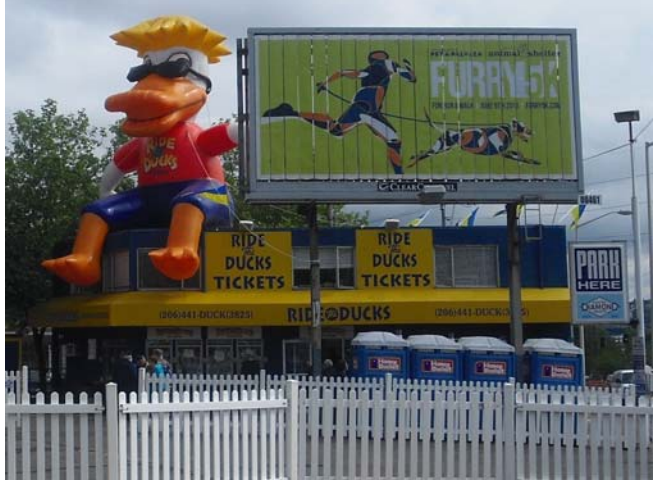
Leaving the hotel and arriving at the 'Duck Port.'