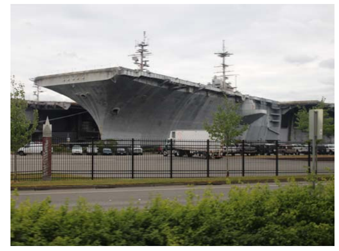
Arriving in Bremerton...