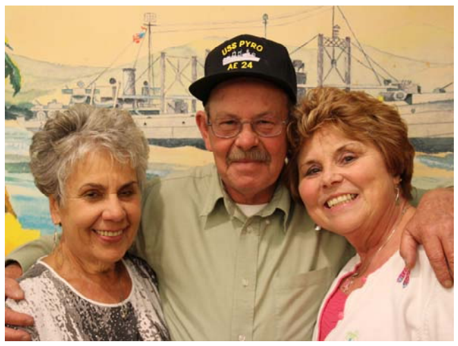
Hunk (not particularly) Porky Parker; Hunk Jack Hon.