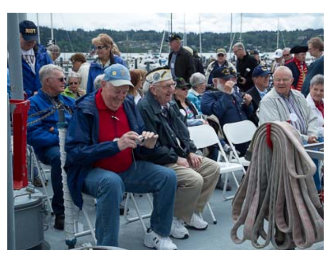
As the crew looks on, the bugler plays Taps.