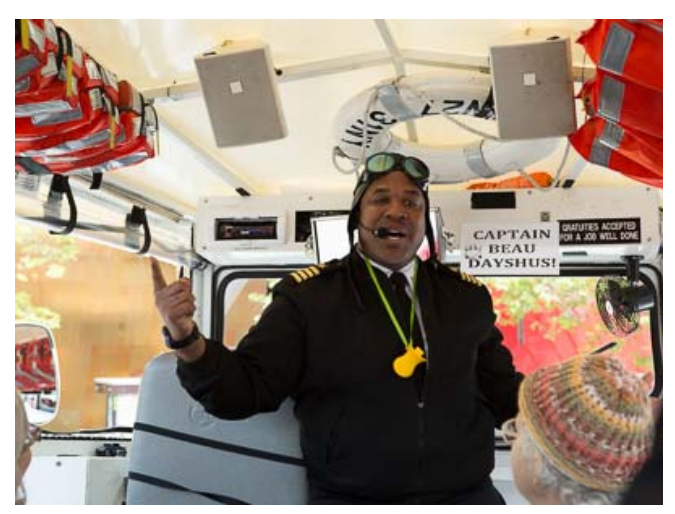
Two boats, two captains, two briefings.