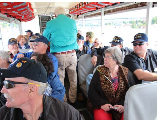
The boys (and girls) on the bus.