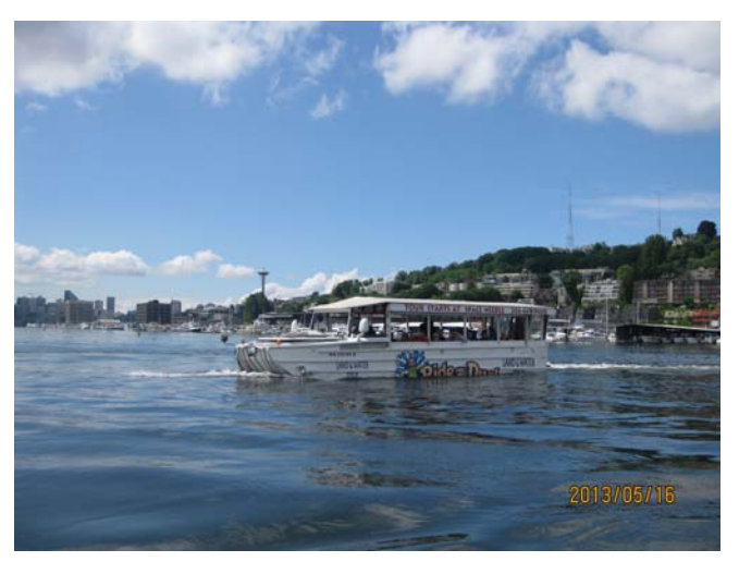
The Duck skipper briefs the crew...and into the briny lake.