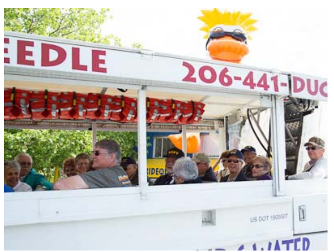
Millers and Moultons, Hiatts et al underway,